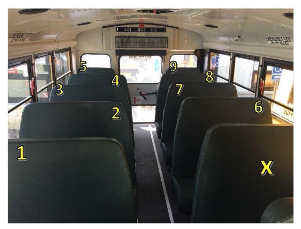
<u>Revised Seating – Small School Bus</u>