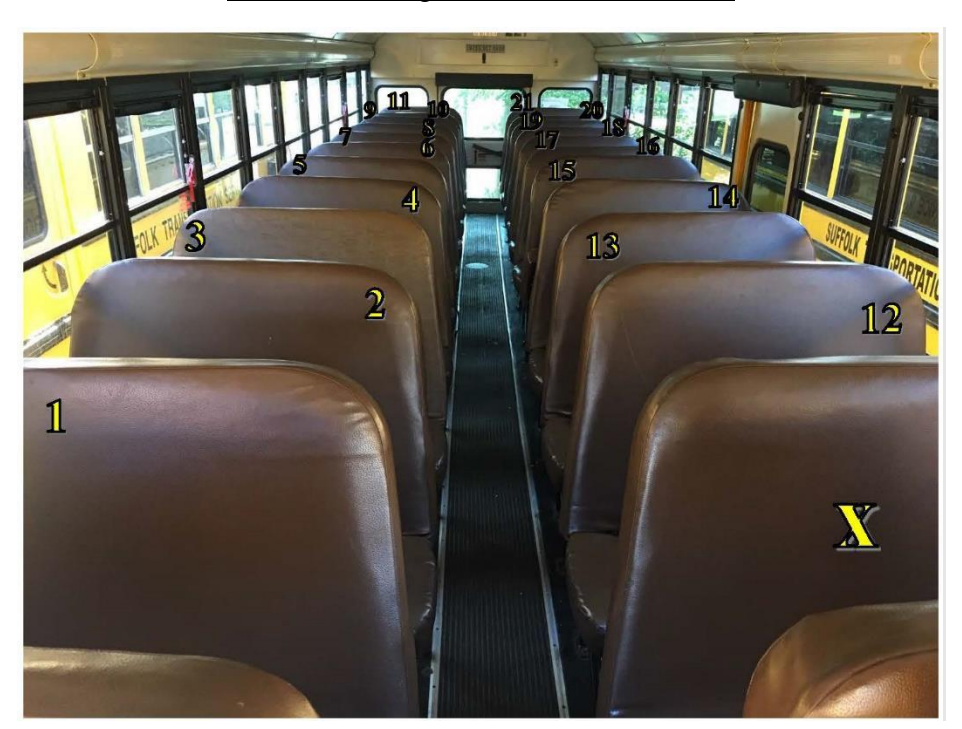
Revised Seating – Standard School Bus

In order to maintain social distancing requirements, students will be seated one child per row on alternate sides of the center aisle the length of each bus. Please see the photos below for examples of this seating arrangement. This will limit capacity on a standard bus to 21 students. The capacity on a small bus will now be nine (instead of 28), and seven students may be seated in a van that would normally hold 12 passengers. Wheelchair vans will now have a capacity of four. Bus routes will be adapted so that all students requiring transportation will have a seat as needed.