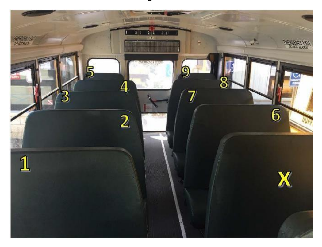
Revised Seating – Van