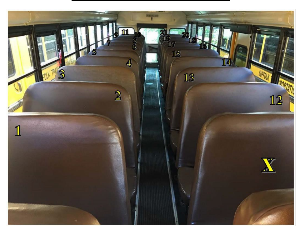
Revised Seating – Standard School Bus

In order to maintain social distancing requirements, students will be seated one child per row on alternate sides of the center aisle the length of each bus. Please see the photos below for examples of this seating arrangement. This will limit capacity on a standard bus to 21 students. The capacity on a small bus will now be nine (instead of 28), and seven students may be seated in a van that would normally hold 12 passengers. Wheelchair vans will now have a capacity of four. Bus routes will be adapted so that all students requiring transportation will have a seat as needed.