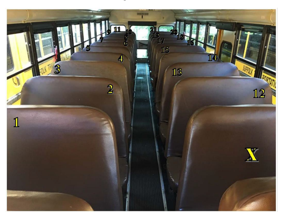
Revised Seating – Standard School Bus

In order to maintain social distancing requirements, students will be seated one child per row on alternate sides of the center aisle the length of each bus. Please see the photos below for examples of this seating arrangement. This will limit capacity on a standard bus to 21 students. The capacity on a small bus will now be nine (instead of 28), and seven students may be seated in a van that would normally hold 12 passengers. Wheelchair vans will now have a capacity of four. Bus routes will be adapted so that all students requiring transportation will have a seat as needed.