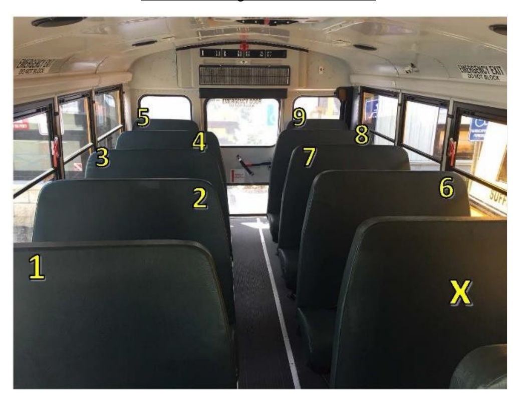
Revised Seating – Van